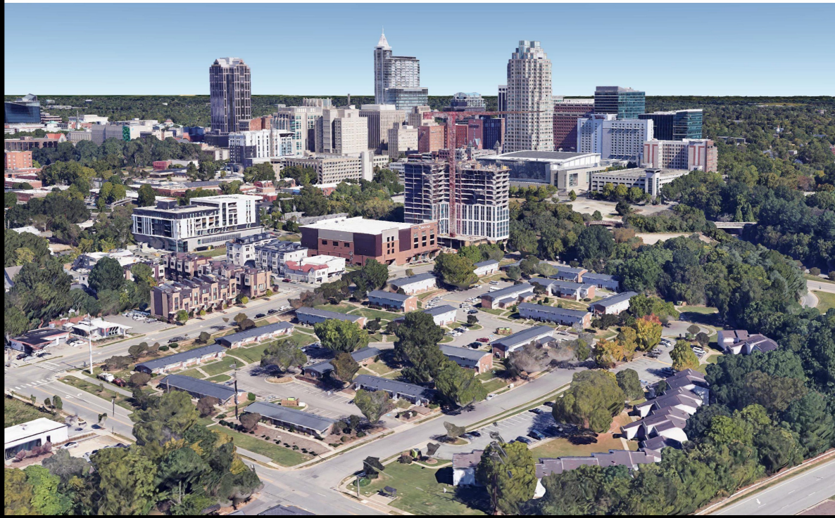
HERITAGE PARK NOW